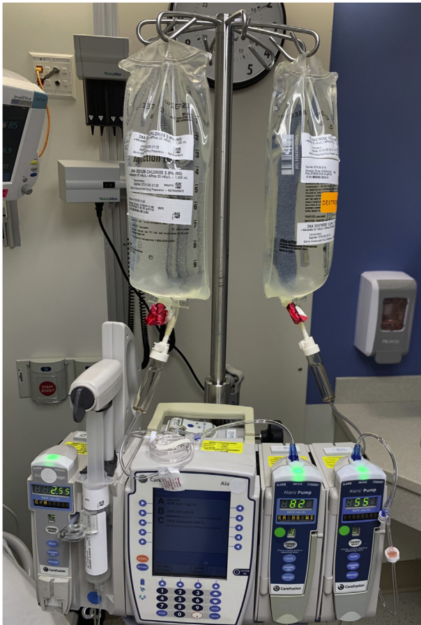
Figure 2. Two-bag fluid system. One bag contains 0.9% or 0.45% saline solution with 10% dextrose, and the other bag contains 0.9% or 0.45% saline solution without dextrose. To prevent hypoglycemia, an infusion of the dextrose-containing fluid is initiated when serum glucose level drops below 300 mg/dL (16.7 mmol/L) and increased to keep serum glucose levels between 150 and 250 mg/dL (8.3 to 13.9 mmol/L). The rate of the nondextrose-containing fluid is decreased accordingly to maintain a constant total fluid infusion rate.

edema. 11 After adjusting for diabetic ketoacidosis severity and degree of dehydration, the rate of fluid administration was not associated with cerebral edema. The only modifiable factor associated with cerebral edema identified after adjustment for diabetic ketoacidosis severity was the administration of sodium bicarbonate, which should be avoided.